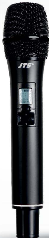
E-7TH Handheld Microphone