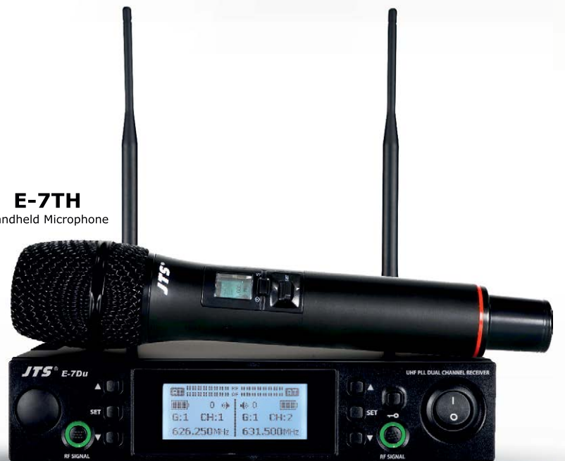
E-7Du UHF PLL dual Channel Receiver